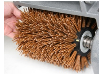
Tool-free, quick and easy brush change.