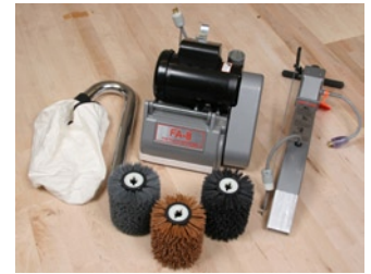
Easily dismantles into three parts for storage and transportation.