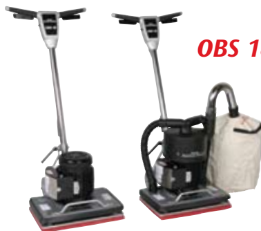
OBS 18 & OBS 18DC

Check out these other great orbital sanders!