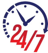
Continuous AntiMicrobial Protection 24/7